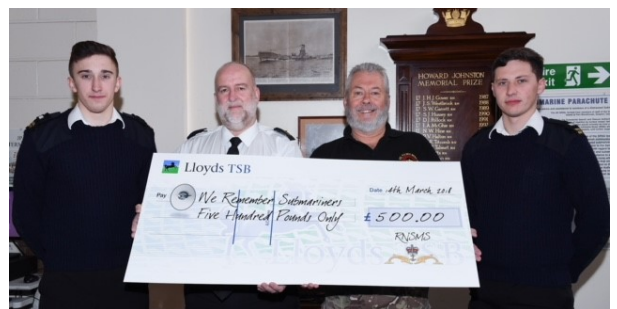
Pictured left to right are: